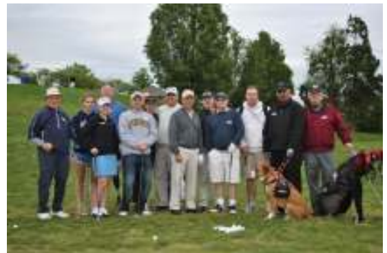
(Above) Instructor goes over swing dynamics during a clinic; (Right/Top) New York City Mayor Michael Bloomberg, FBI Director Robert Mueller and Sec. of Defense Leon Panetta; Mayor Bloomberg with Wounded Warriors